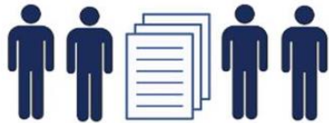
Expert panel and research reports

Linking clinicians with the best minds and latest trends in the field through an expert panel and reports of your field's latest trends.